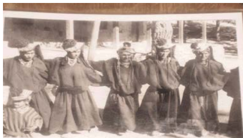
Photograph VI: The Original Kalash Woolen Traditional Dress of the Past Worn With Metallic Jewelry, Photographure Taken in Greek Museum Brun, Bumburet Valley, Kalash

long pure black woolen kimono style dress. The women in the past were supposed to wear woolen cloth in all the seasons. They weave the fabric on a hand loom and then stitch. The utilization of cotton fabric is a relatively new phenomenon. In 1974, they performed in Islamabad on the invitation of late Prime Minister Zulfikar Ali Bhutto. Here they were supplied with the cotton dress, especially designed for them according to their traditional style. This cotton dress was instantly rejected by the natives and was referred to as an ugly and lighter dress. The people resisted the idea of changing their traditional fabric as they regarded it a direct attack on their traditional heritage but soon they realized the convenience and comfort allied with the cotton material. Now the woolen dress is a delicacy and there are few proud owners who possess it. Normally it is seen in the Greek Museum of Bumburet valley. In the past customarily people donned new dress just once a year only on joshi festival but now due to some financial stability they can afford new dresses before every religious festival.