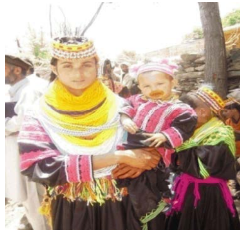
Photograph V: The Contemporary Kalash Mother with her daughter, Village Karakal, Bumburet Valley

the customary colour of mourning for men and women of Europe since the fourteenth century. However, it is imperative to note that though there is a prevalent use of black to represent death, it is not the universal colour of mourning; neither has it always provided the funeral hue even in Western societies [21]. They also used black for their highly formal occasions like a black tie party where it is customary for the guests to conform to the code and the occasion is regarded as most exquisite. In relation to the Kalash culture, black colour is associated with both festivities and mourning. They use symbols to generate meaning like there are certain codes of conduct applied to female traditional attire of Kalash. Kalash females are supposed to wear their kupas in their seasonal festival but if a person dies, the women of his clan will remove their kupas and susit , with their hair unbraided until the dead is buried. Women when seen without her kupas and susit with a cloth wound on her shoulder is the indication that she is menstruating and on her way to " bashalini ". This symbolizes the state of impurity and therefore any physical contact is avoided.