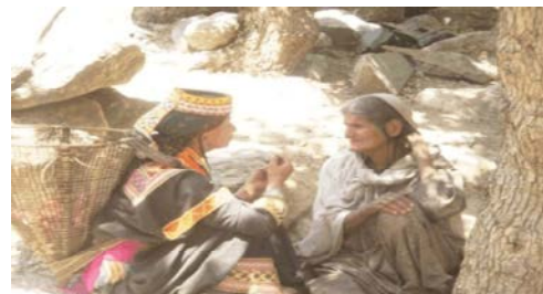
Photograph IV: Two real sisters Kalasha and converted Muslim: Analysis of the style of head braid signifies their unconscious attachment to their true identity

Their Dress: The traditional symbols for Kalash women identity are their distinctive braids along with their attire. The hair have to be braided tightly so that no hair fall in the kitchen or home as the broken hair are considered sacrilegious and impure. This is actually the reason that the women folk take bath and wash their hair by the flowing stream, carefully combing wet hair and braiding them. The converted Muslim women who joined the Islamic community give up their traditional attire but they continue the practice of braiding which reflect their desire to cling to some resemblance of their own original identity even after becoming Muslim. This very action casts a doubt on their conversion to Islamic faith; but may be, in reality, it is their innate desire to hold on to their uniqueness in the wider, absorbing Islamic culture or just a habit.