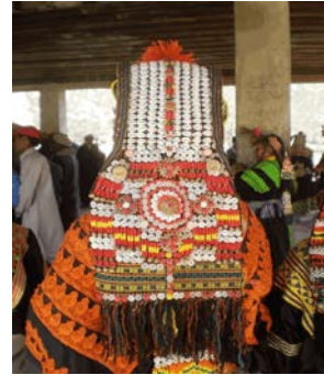
(Photograph: viii) Traditional kupas the Major Head Dress

Kupas (The Major Head Dress): The major head dress is an integral part of Kalash identity. This is a very heavy item without any strings or attachments and is a bit difficult to carry. The locals regard this as a very useful item because it provide shield from the sunrays. The Kupas are extremely formal in nature and are only used on feasts and festivals. It is similar to a scarf approximately 20 inches long and 10 inches wide and is heavily decorated with the cowries, sea shells, buttons and decorative stitches. The front of kupas is called horn [43] it covers the base of the head and its tussled tail hangs down the back. Kupas are placed on the minor head dress sus~ut and are not stitched or tied with the base of the ring. They are supported by the balanced and erect posture of the females. Traditionally the girl receives her kupas when she is four year of age on the winter chamois festival. It also like susit symbolizes their distinctive identity. They instruct the girls not to play with their kupas otherwise the deities will be angry and they might be cursed. The traditional kupas is similar for all three valleys in size and construction. The only difference can be found in the way the cowries and embellishment are attached. The variations induced when liked by the masses later become the fashion. These fashions are simply created due to necessity like females by rolled the front of kupas for better stability. This has introduced a new trend in the region (Parkes) [44].